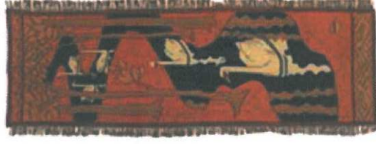
"Fünf Schwäne", 1896/97, Entwurf Otto Eckmann